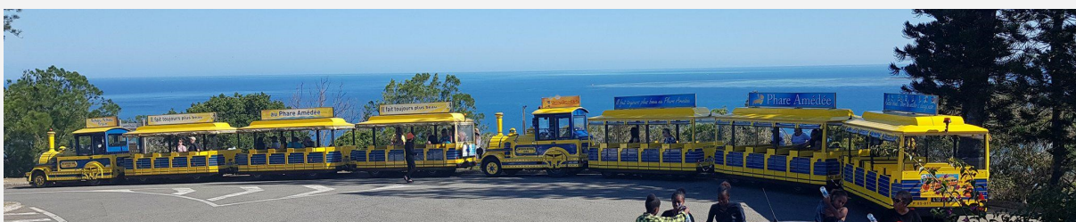
Tchou Tchou Train tour Noumea