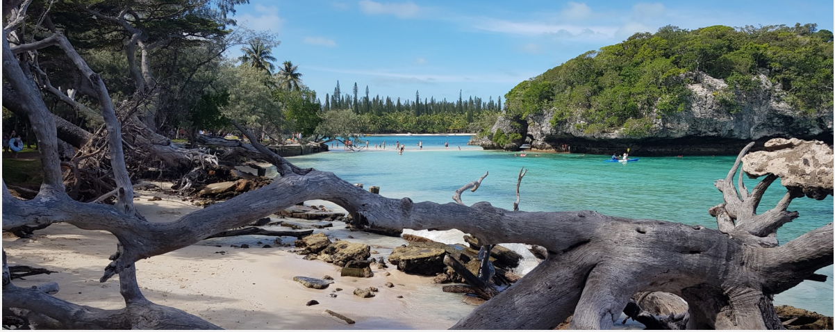
Isle of Pines