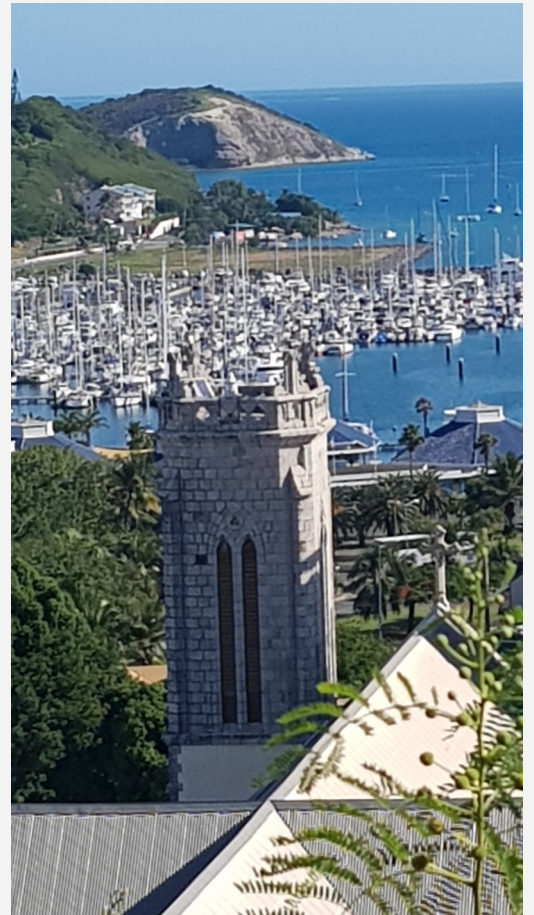
Noumea view of the Marina