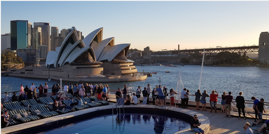
Magnificent Sydney Opera House