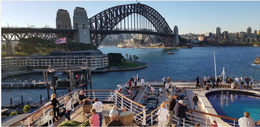
Cruising out of Sydney